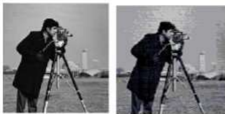
Figure 4 Original and Decompressed Image of cameraman after 3760 epochs

The graph shown in figure 1 represents the output of the training of the network and 3760 epochs have been taken to get trained the network using the traingda train function. In this case the performance goal of the network has been 391.127.