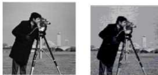
Figure 2 Original And Decompressed Image Of cameraman after 1100 epochs

The graph shown in figure 1 represents the output of the training of the network and 1100 epochs have been taken to get trained the network using the training function. In this case the performance goal of the network has been 644.412.